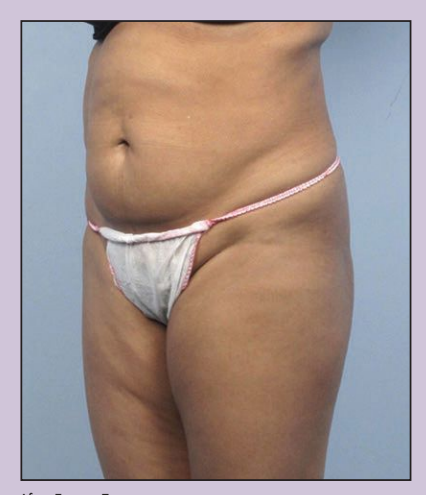
After Zerona Tx

"I carefully select my patients and see satisfaction rates as high as other prominent aesthetic treatments such as injectables, breast implants or liposuction. It's undeniable that it works."