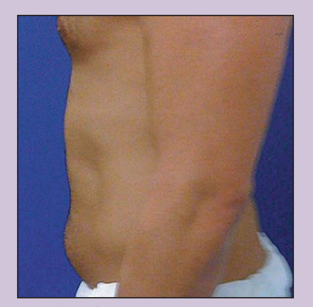
8.74" reduction after Zerona Tx

"In the multicenter study we went as far as eight months after completion of the course of treatment and found virtually no change in circumference for either group. This suggests a long-term effect."