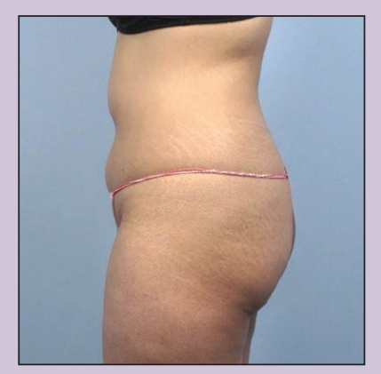
After Zerona Tx