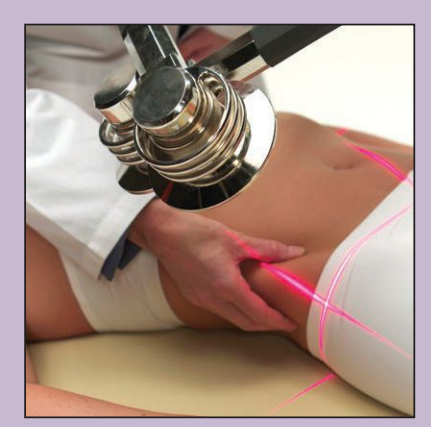
Zerona Tx