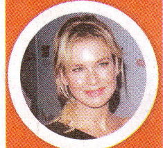
Kim Kardashian, Sharon Osbourne, Robbie Williams, Jennifer Aniston and Renee Zellweger