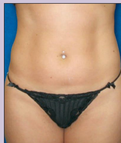
After Zerona Tx