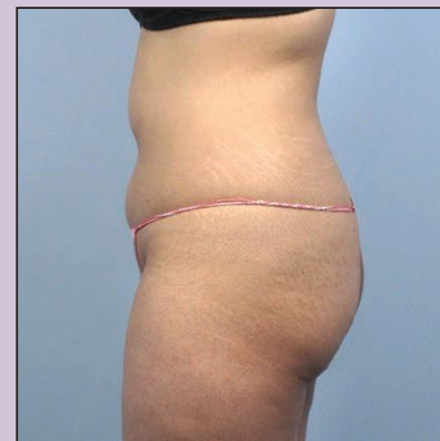
After Zerona Tx