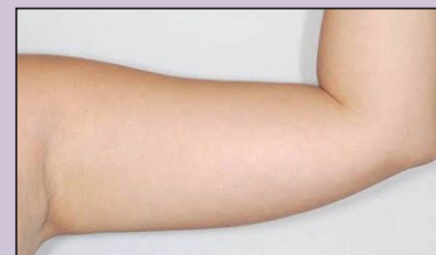
2.5" reduction after Zerona Tx