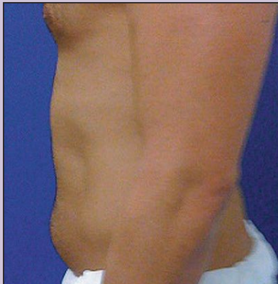
8.74" reduction after Zerona Tx