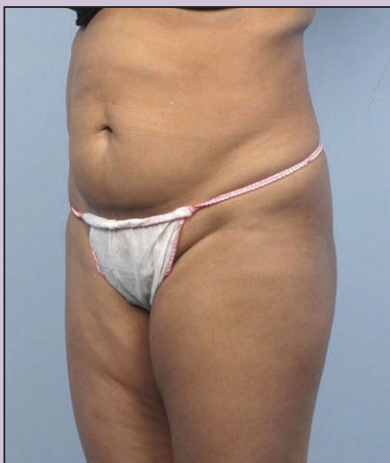
After Zerona Tx